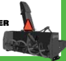
TWO STAGE 3-PT INVERTED SNOWBLOWER